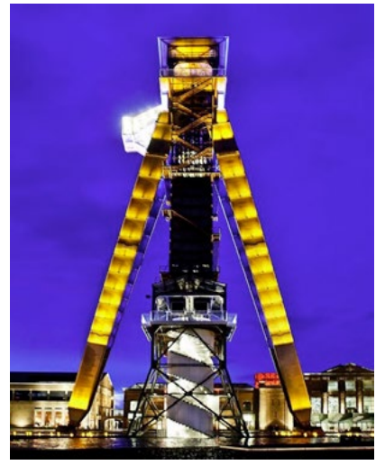
An image of the former coal-mining site in Genk, Belgium, transformed by the project <u>C-mine</u>)