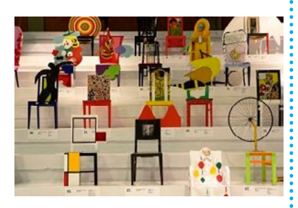
A picture from the project Art on chairs

chambers of commerce to businesses, municipal authorities, universities and schools, allowing the transfer of knowledge and expertise from local universities to the furniture industry. Total investment: € 1,095,535 (of which EU contribution through the ERDF: € 931 205).