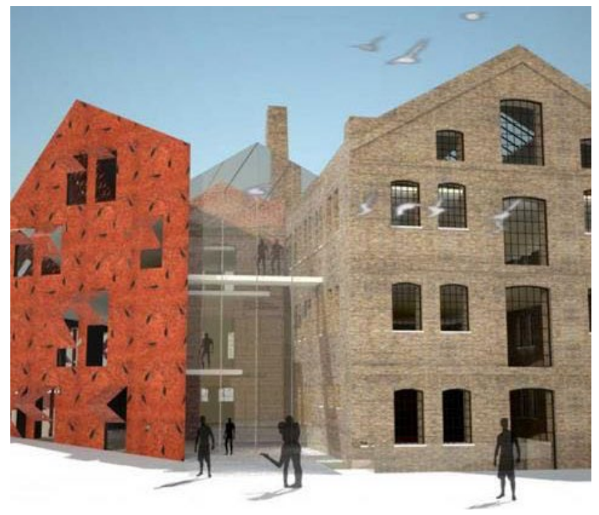
A picture from the Specifi project

Interreg Va provide 60-70% contribution to the total (eligible) project budget (i.e.