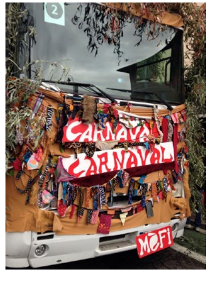
picture from <u>The management of the festive rituals</u> in the public areas project

The programme reaches individuals through organisations, institutions, bodies or groups that organise such activities. The specific conditions for the