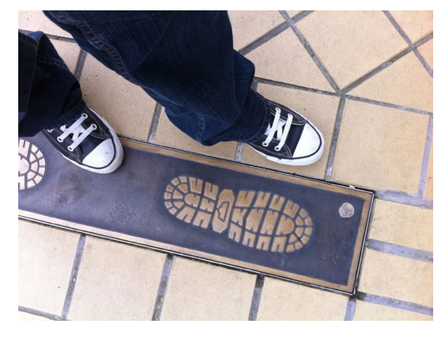
Walking in Hamish's footsteps - picture from the project Time and Place

Specific lists of potential beneficiaries of the projects are available for each investment priority in each programme but generally include SMEs, social enterprises and not-for-profit organisations, universities, intermediary agencies and local or regional authorities, and the general public including excluded populations or those at risk of exclusion.